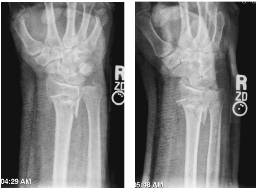
Figure 1 Initial injury.

proximal screws were loosened, noting that none of them had come loose. An osteoclysis was performed and the plate was readjusted along the proximal and distal extent. After a reduction was performed, the original plate was reinstalled with tightening of the proximal screws and insertion of distal locking screws. Postoperative and follow-up examinations revealed maintenance of the reduction (Fig. 4).