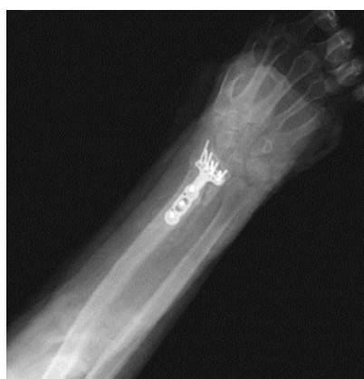
Figure 4 Revision and revised reduction.