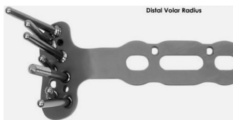
Figure 2 DePuy Hand Innovation Distal Radius Plate.

A study by Arora and colleagues 5 examined the potential surgical risks and the observed complications of operative fixation of distal radius fractures. Over a mean 15-month period, 112 consecutive patients treated for an unstable dorsal dislocated distal radius fracture using the palmar locking-plate system were assessed. The functional results were compared with the uninjured contralateral side. From their study, favorable indications for palmar locking plate osteosynthesis are A2, A3, C1, and C2 fractures with large distal fracture fragments. In these cases, additional bone